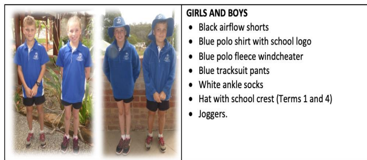
SUMMER UNIFORM (Term 1 and Term 4)