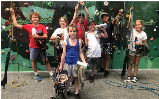
The Year 6 class on one of the many activities they Undertook on their camp.