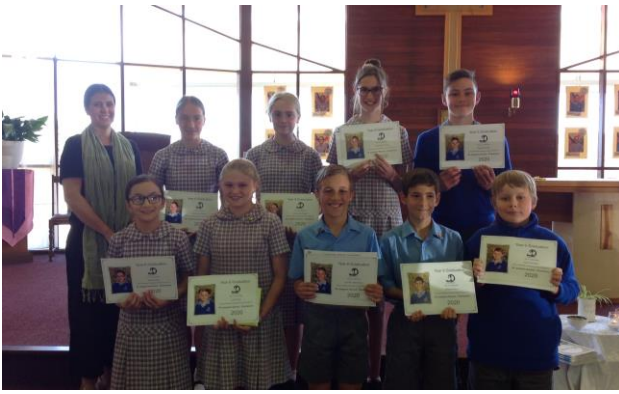
Our graduating group of Year 6 students.