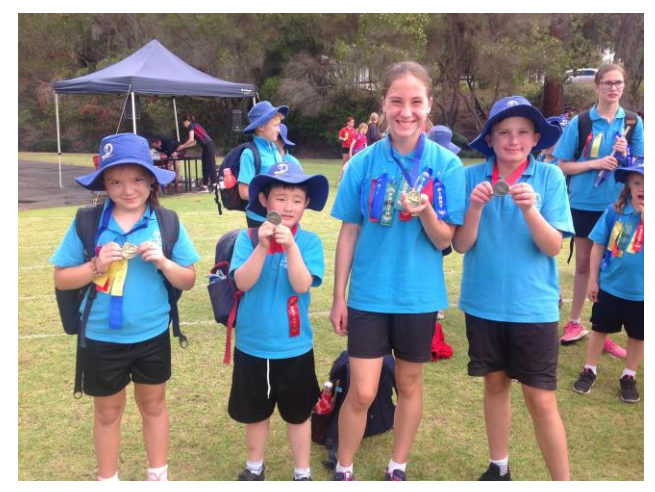
We enjoyed another successful Athletics Carnival last week.