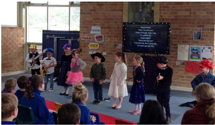
Kindy and Pre-Primary performing at their recent Assembly.