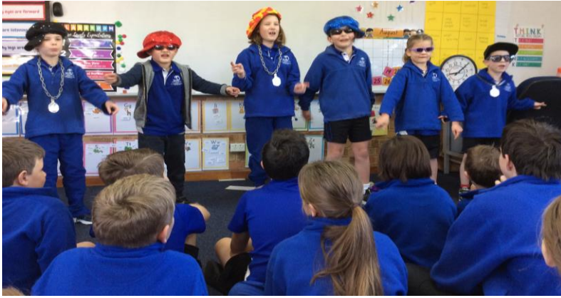
A highlight from last week's Year 1/2 'Respect' Assembly