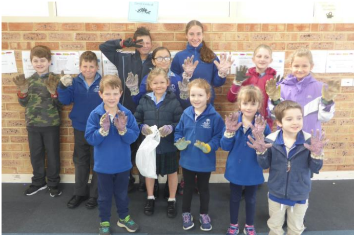
The gardening crew ready for their community service activity.