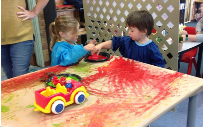
Little Joeys is underway!