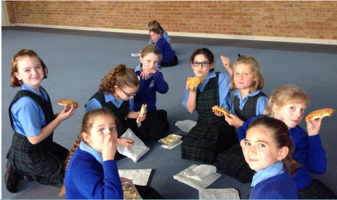
THE YEAR 3/4 GIRLS LOVING THE CANTEEN BEING BACK!