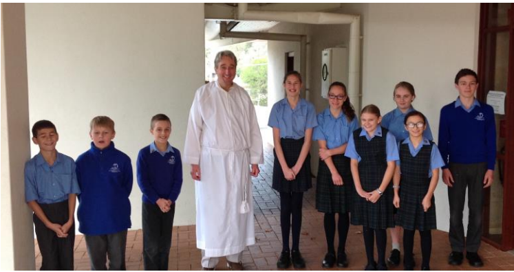
OUR YEAR 6 STUDENTS AFTER THEIR CLASS MASS