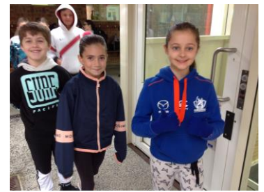
Students enjoying free dress for 'Casuals for Catholics'.

St Joseph's School PO Box 415 12 Guppy Street, Pemberton WA, 6260.