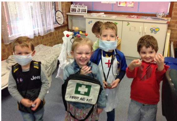
OUR KINDY AND PP STUDENTS LOVING THE NEW HOSPITAL HOME CORNER