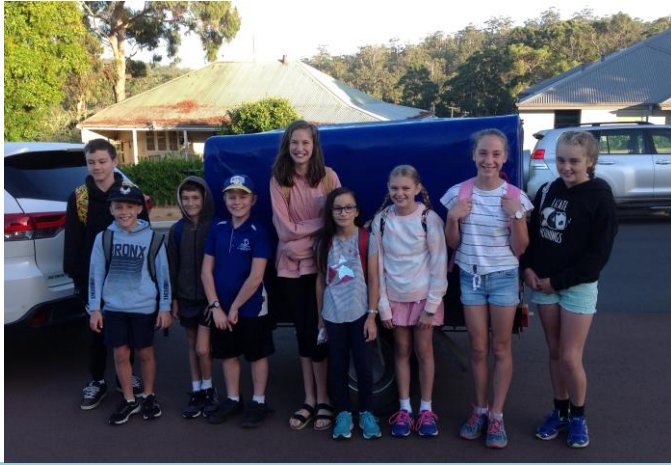
ENJOY CAMP YEAR 6!