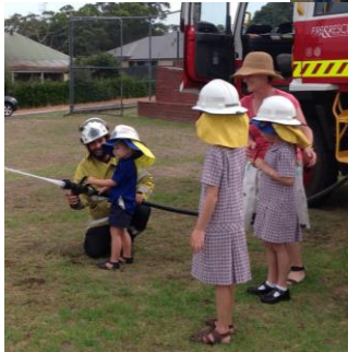
Highlights of the fire incursion