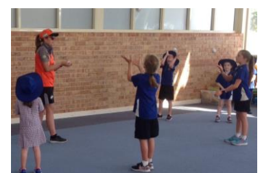
Highlights of Cricket Blast Incursion