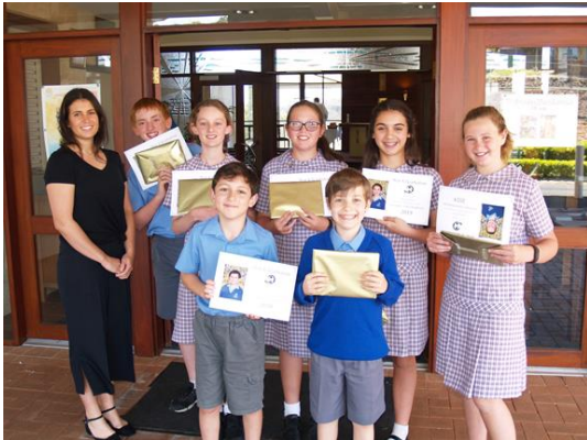
Our Year 6 graduating class