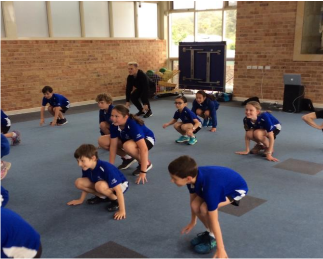
Highlight of the recent Dance Workshop