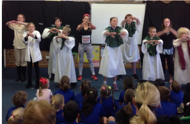
Year 5 and 6 presented a brilliant Assembly!