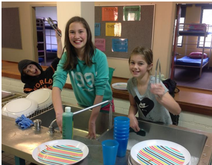
At Bridgetown Camp, even doing the dishes is fun!