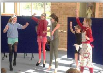
Year 5 / 6 Girls These girls love to dance...

Wow, what a fun afternoon we had yesterday, at our Saint Joe's Got Talent event!