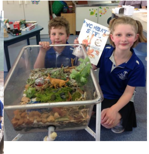
K/P/1 have enjoyed re-creating the setting of 'Wombat Stew' and creating an Aussie Bushland environment.