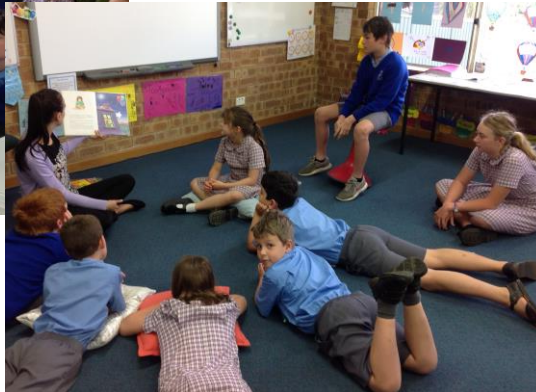
Students enjoying morning reading during BookWeek