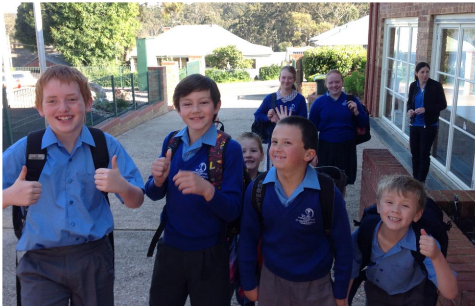
Happy students returning for Term Four!